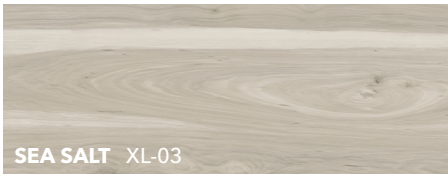
SEA SALT XL-03